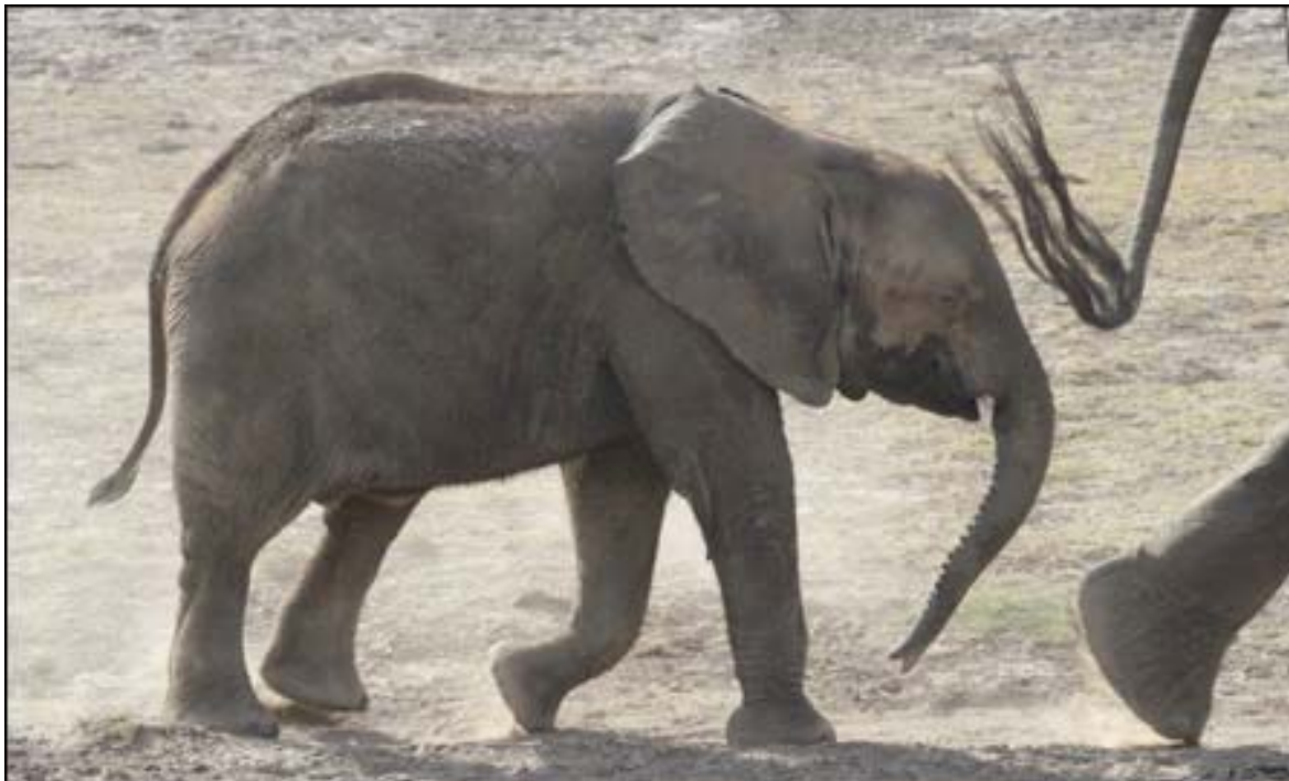
Elephant populations around Africa face an uncertain future