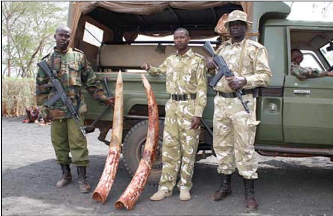
The Kenya Wildlife Service got to these tusks before the ivory thieves