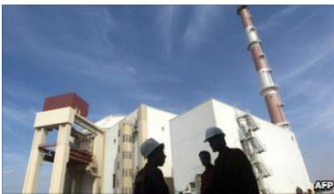
The Bushehr nuclear plant has been hit by repeated delays

Iran has confirmed it is having to remove nuclear fuel from the reactor at the Bushehr power plant, the latest in a series of delays to hit the project.