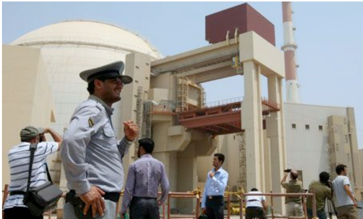
Iran's Bushehr nuclear power plant.