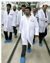
President Mahmoud Ahmadinejad of Iran toured the Natanz plant in 2008.

The worm itself now appears to have included two major components. One was designed to send Iran's nuclear centrifuges spinning wildly out of control. Another seems right out of the movies: The computer program also secretly recorded what normal operations at the nuclear plant looked like, then played those readings back to plant operators, like a pre-recorded security tape in a bank heist, so that it would appear that everything was operating normally while the centrifuges were actually tearing themselves apart.