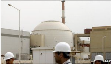
Iran's Bushehr reactor is believed to have been one of the intended targets for Stuxnet.

Israel and the United States created the Stuxnet worm to sabotage Iran's nuclear programme, a leading security expert has claimed.