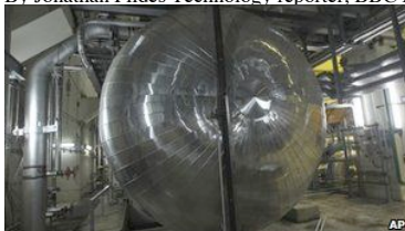
Stuxnet may have been designed to target Iran's nuclear programme