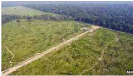
Cattle farming, crop production and logging are the main drivers of illegal clearing of the rainforest

"Production and the environment will only benefit from that. With a confused law there is no benefit," he said.