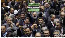
Wednesday's vote capped months of bitter political argument

The Brazilian Chamber of Deputies has approved controversial legislation that eases rules on how much land farmers must preserve as forest.