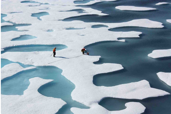
Coast Guard crew members at work on a mission with NASA to study changing Arctic conditions. Exxon has used such studies to help plan future operations.