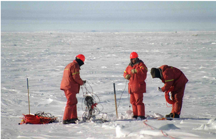
Seismic lines are used to detect natural gas and other underground deposits on the frozen Beaufort Sea.