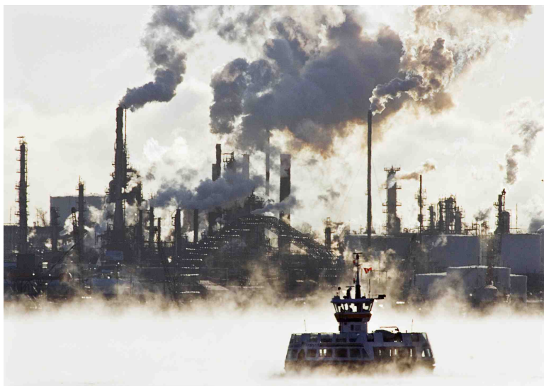
Imperial Oil’s Dartmouth refinery in Halifax, Canada. Exxon Mobil owns about 70% of the company.

The Arctic holds about one-third of the world’s untapped natural gas and roughly 13% of the planet’s undiscovered oil, according to the U.S. Geological Survey. More than three-quarters of Arctic deposits are offshore.