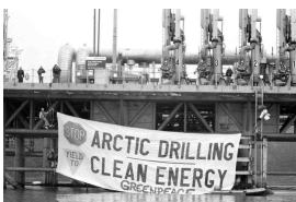
Members of the environmental group Greenpeace work to hang a banner protesting oil drilling at the Alyeska Pipeline Service Co.’s Valdez, Alaska terminal, on August 5, 1991.