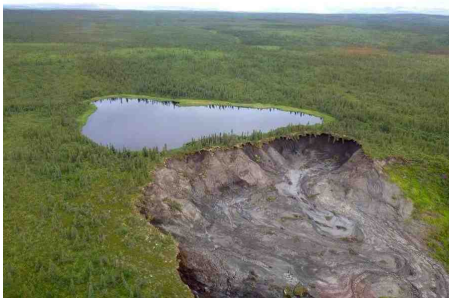
Top, the loss of sea ice due to climate change has taken a toll on wildlife. Bottom, rapidly thawing permafrost is changing the landscape in Canada's Northwest Territories.