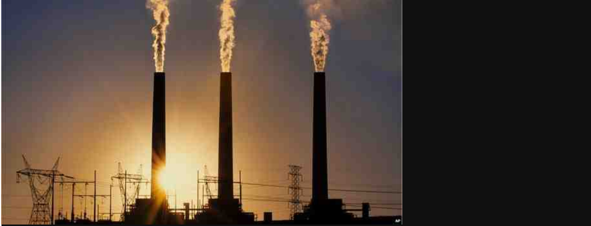
US power stations are the country's largest source of greenhouse gases

"If we don't do it nobody will. America leads the way forward... that's what this plan is about. This is our moment to get something right and get something right for our kids," he said.