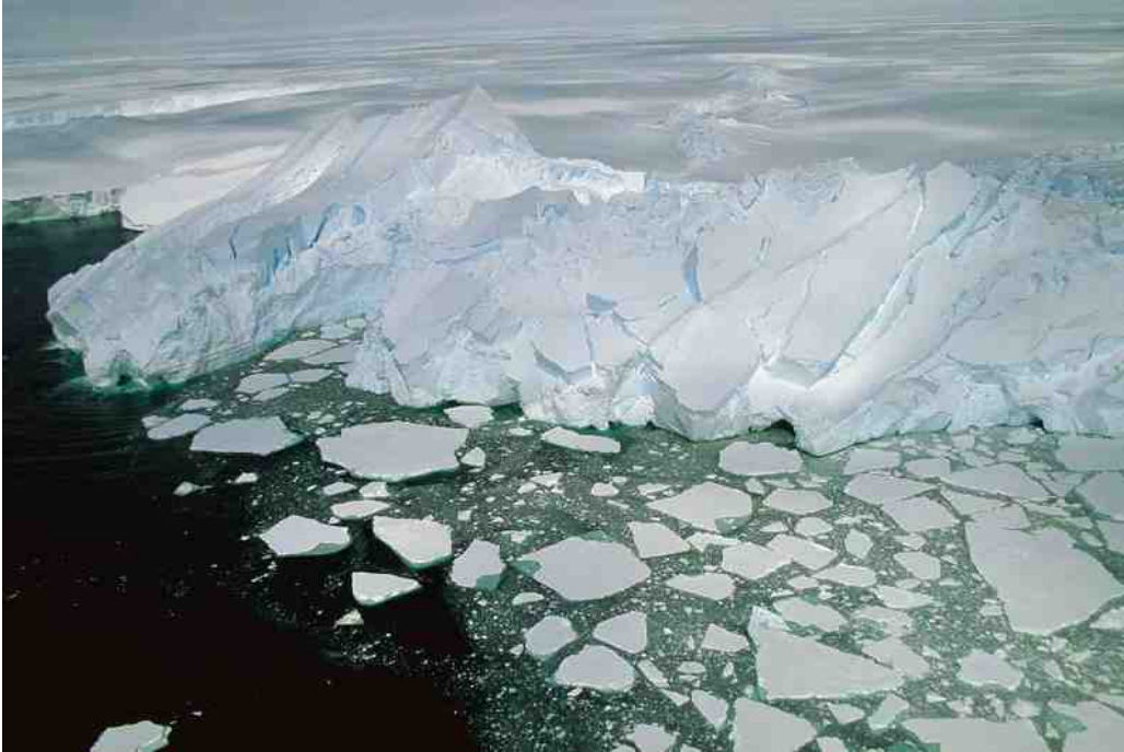
We're on thin ice when it comes to sea level rise

A massive rise in sea level is coming, and it will trigger climate chaos around the world. That was the message from a controversial recent paper by climate scientist James Hansen. It was slated by many for assuming – rather than showing – that sea level could rise between 1 and 5 metres by 2100.