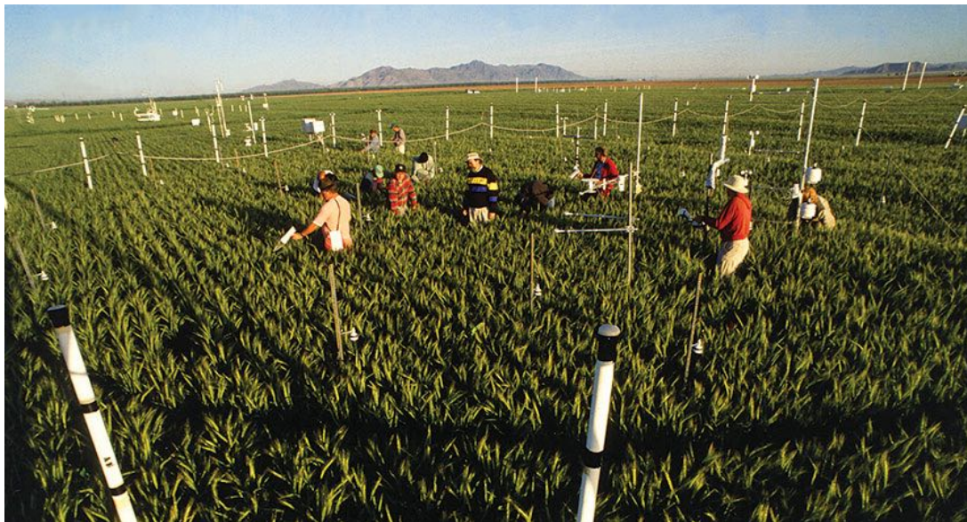
CROP FUTURES Experiments using circles of white pipes blowing extra carbon dioxide over crops suggest that certain nutrients may dwindle in crops grown in a carbon-enhanced future atmosphere. Here, researchers in Arizona measure the growth of wheat.

BY SUSAN MILIUS 3:07PM, MARCH 13, 2017 Science News