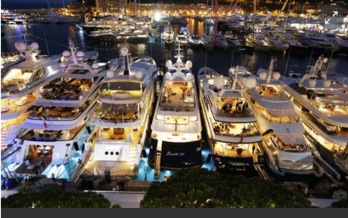
Yachts in Monaco. The number of people classed as high net worth individuals grew to 16.5 million.