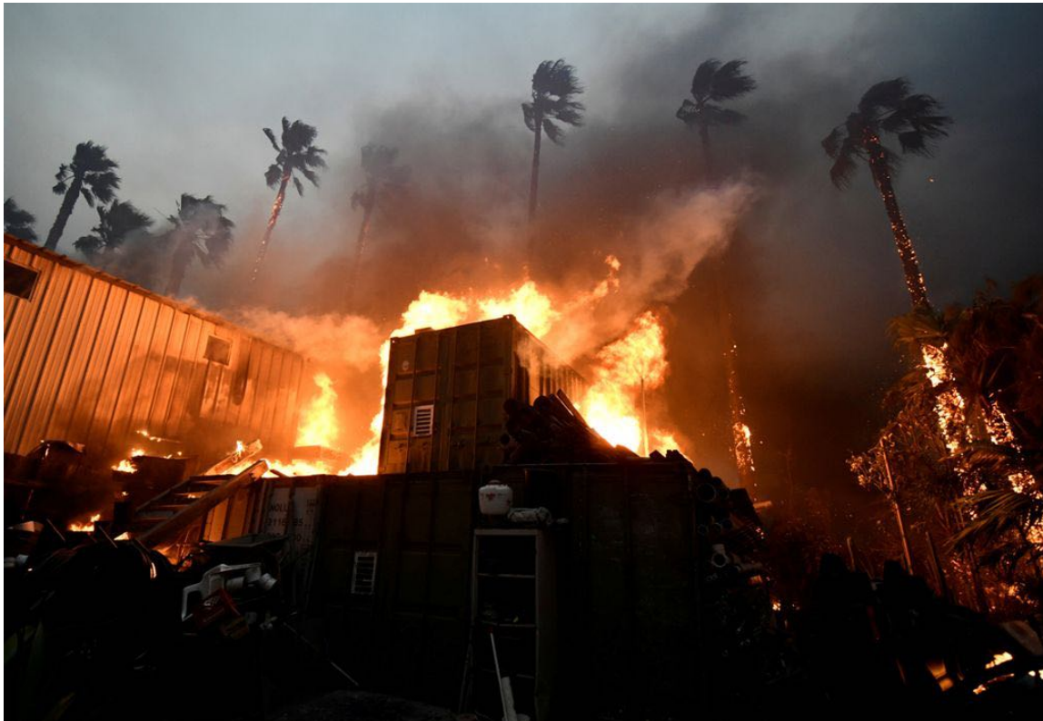
Devastating wildfires ravaged California last month.