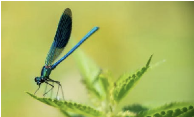
The dragonfly is among more than a million species of insect.

Last modified on Sun 10 Feb 2019 19:35 GMT