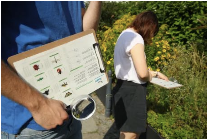
German conservation workers inspect an urban garden for insects.

He thinks new classes of insecticides introduced in the last 20 years, including neonicotinoids and fipronil, have been particularly damaging as they are used routinely and persist in the environment: “They sterilise the soil, killing all the grubs.” This has effects even in nature reserves nearby; the 75% insect losses recorded in Germany were in protected areas.