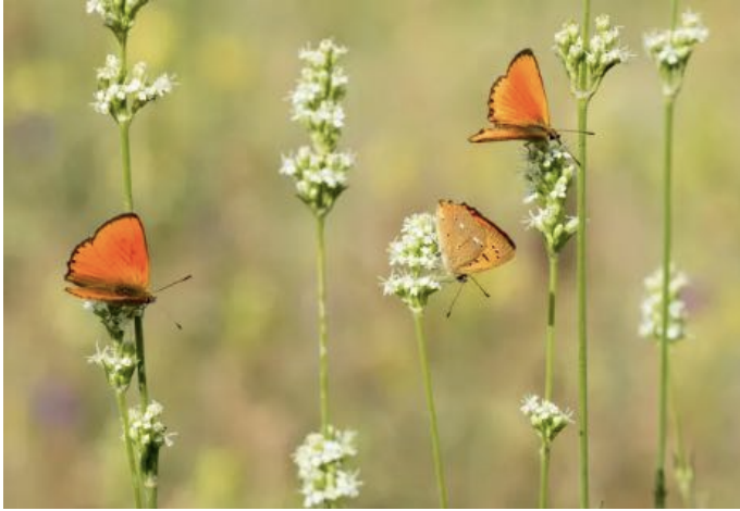
Scarce copper butterflies.

The analysis, published in the journal Biological Conservation , says intensive agriculture is the main driver of the declines, particularly the heavy use of pesticides . Urbanisation and climate change are also significant factors.