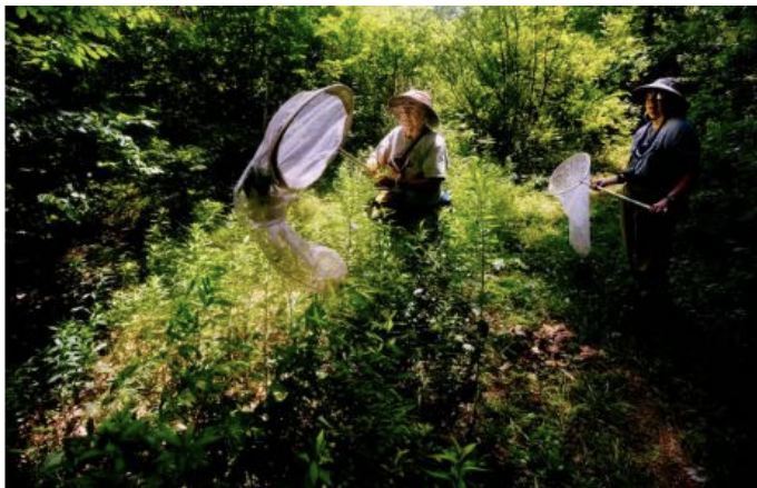
Surveying butterflies in Maine, US.

The new analysis selected the 73 best studies done to date to assess the insect decline. Butterflies and moths are among the worst hit. For example, the number of widespread butterfly species fell by 58% on farmed land in England between 2000 and 2009. The UK has suffered the biggest recorded insect falls overall, though that is probably a result of being more intensely studied than most places.