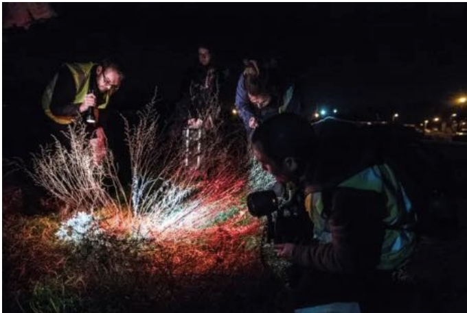
Volunteers look for the wormwood moonshiner beetle in Suffolk, UK.

global effort to halt and reverse these dreadful trends.” In his opinion, the review slightly overemphasises the role of pesticides and underplays global warming, though other unstudied factors such as light pollution might prove to be significant.