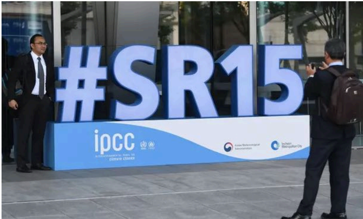
Attendees take a photo before the opening of the 48th session of the IPCC in Incheon.

At 2C extremely hot days, such as those experienced in the northern hemisphere this summer, would become more severe and common, increasing heat-related deaths and causing more forest fires.