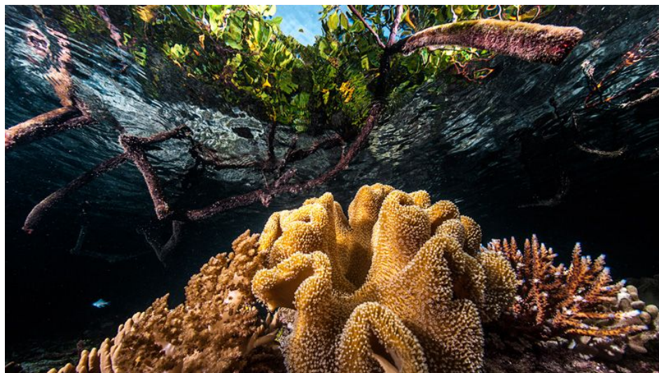
Coral in a mangrove swamp in the Raja Ampat Islands, Indonesia.