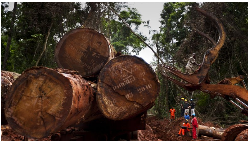
Workers cut down trees in southeast Cameroon as part of a sustainable initiative to help local groups with forest management.

This results from human activities such as forest clearance for illegal coca crops, cattle ranching and mining. The finding has prompted the Colombian government to focus on the amount of land given protected area status, and to consider the restoration of critically endangered ecosystems.