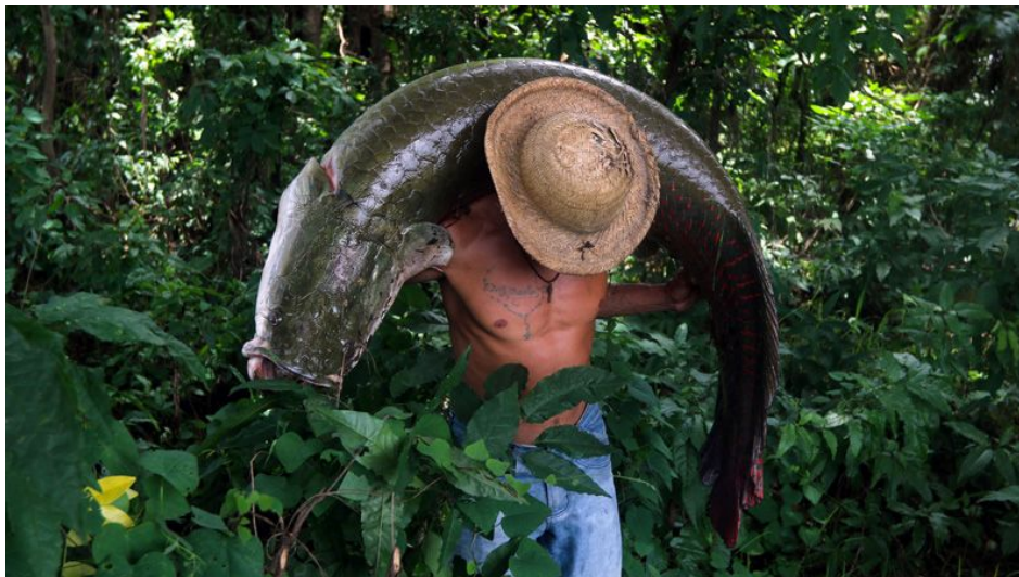
Human impacts such as overfishing have affected the Amazon River ecosystem in Brazil.

Such species-focused conservation activities are crucial. But they are not sufficient to sustain biodiversity and the benefits of nature to humanity.