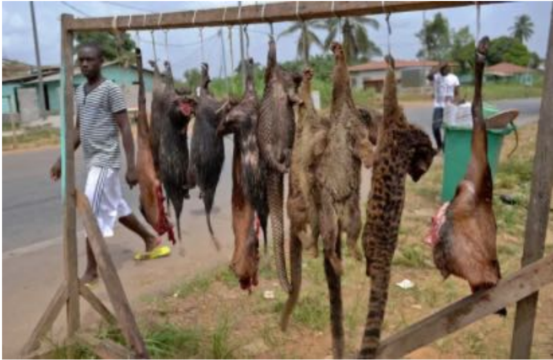
A bushmeat stall with pangolins, bush rats and tiger cats for sale on the roadside outside Bata in Equatorial Guinea.