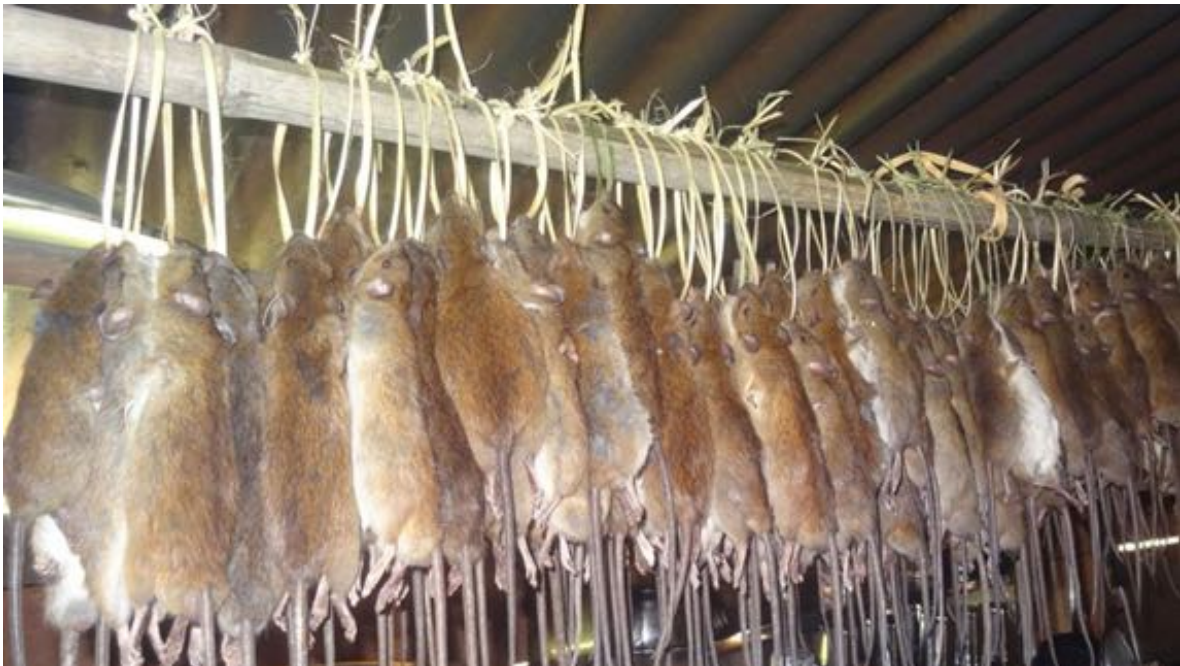
Bushmeat is one channel through which viruses can travel from wild animals to humans.

“Wet markets make a perfect storm for cross-species transmission of pathogens,” says Gillespie. “Whenever you have novel interactions with a range of species in one place, whether that is in a natural environment like a forest or a wet market, you can have a spillover event.”