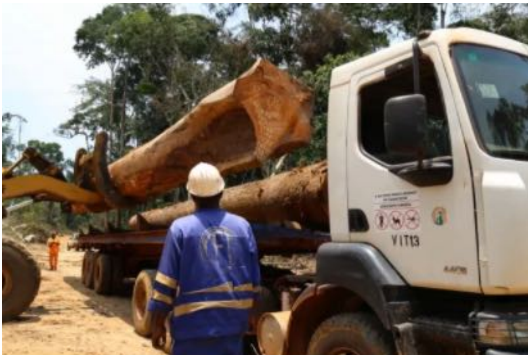
The disruption of pristine forests driven by logging, mining, road building, rapid urbanisation and population growth is bringing people into closer contact with wildlife, increasing the risk of disease.

Gillespie sees this in the U.S., where suburbs fragmenting forests raise the risk of humans contracting Lyme disease. “Altering the ecosystem affects the complex cycle of the Lyme pathogen. People living close by are more likely to get bitten by a tick carrying Lyme bacteria,” he says.