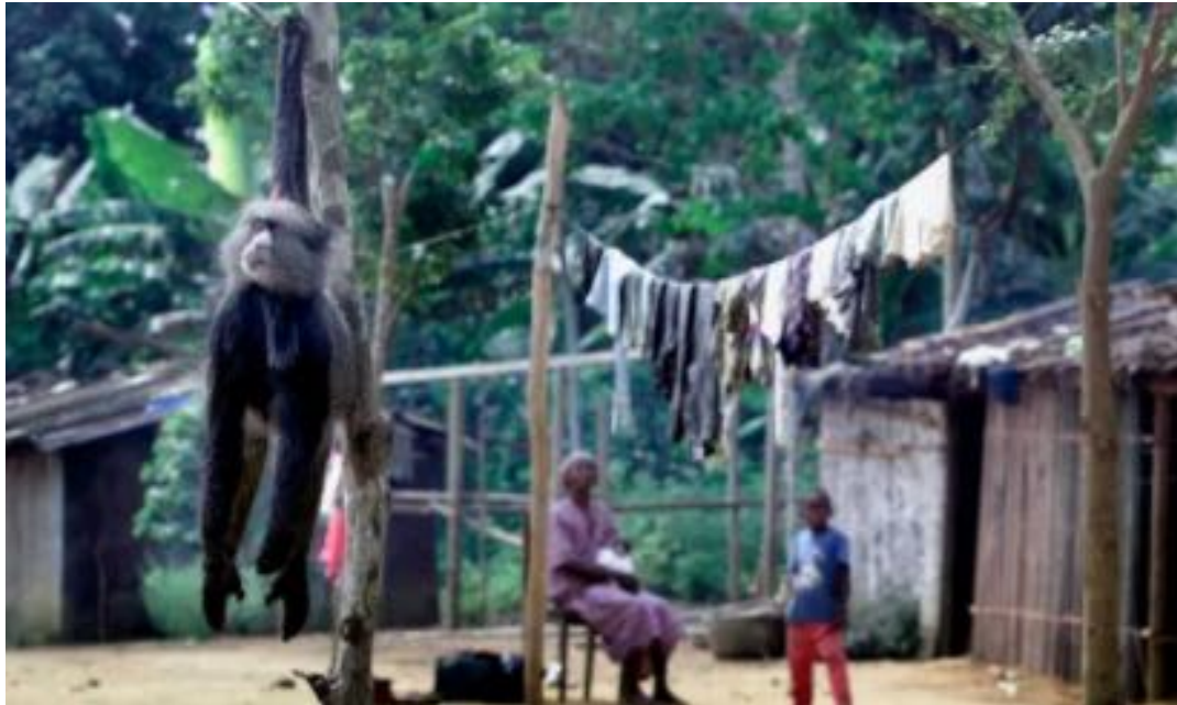
A dead monkey sold as bushmeat hangs outside a villager's house in north-east Gabon.

I traveled to Mayibout 2 in 2004 to investigate why deadly diseases new to humans were emerging from biodiversity “hot spots” like tropical rainforests and bushmeat markets in African and Asian cities.