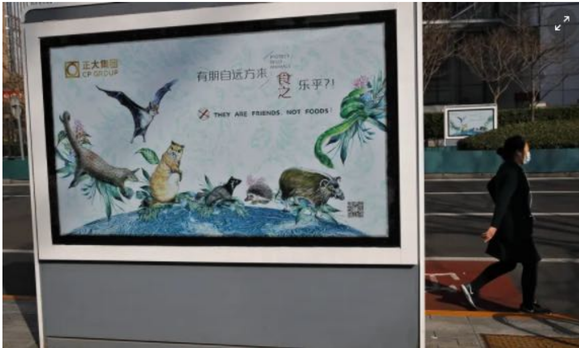
A poster in Beijing promoting wildlife as friends instead of food, after a crackdown on wild animal markets following the coronavirus outbreak.

“Diseases are more likely to travel further and faster than before, which means we must be faster in our responses. It needs investments, change in human behavior, and it means we must listen to people at community levels.”