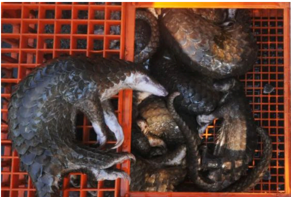
Dead pangolins seized by authorities in North Sumatra. Disease ecologists argue that viruses and other pathogens are likely to move from animals to humans in wildlife markets.