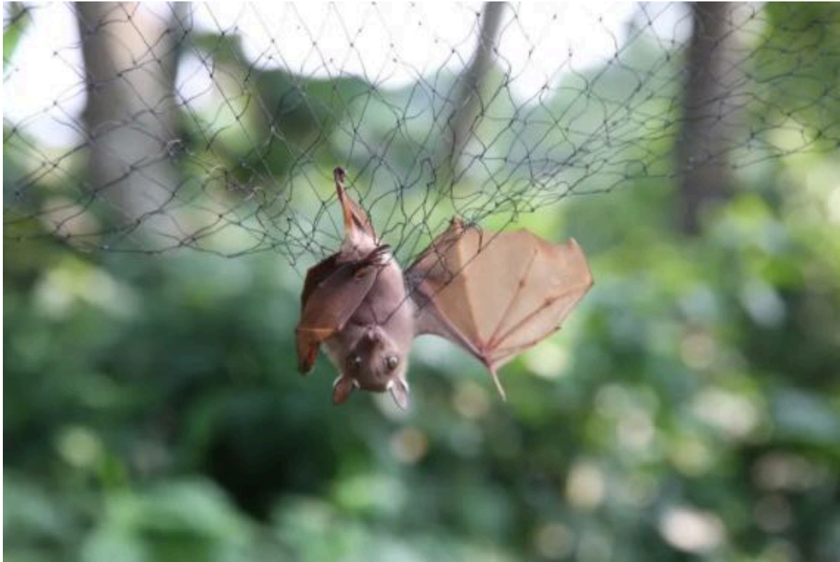
Bats are trapped in nets to be examined for possible viral load at the Franceville International Centre of Medical Research in Gabon.