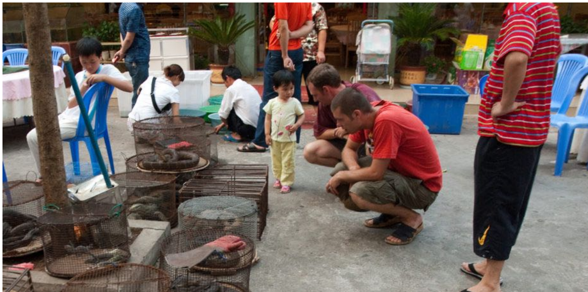
Illicit Endangered Wildlife Trade in Mōng La, Shan, Myanmar

As habitat and biodiversity loss increase globally, the novel coronavirus outbreak may be just the beginning of mass pandemics