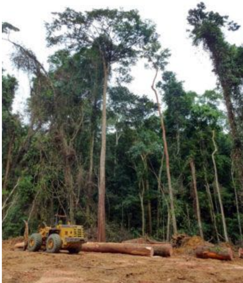
Logging and other habitat disruption creates new opportunities for disease organisms to move from non-human animals to people.

wildlife threatened humans by harboring the viruses and pathogens that lead to new diseases in humans like Ebola, HIV and dengue.