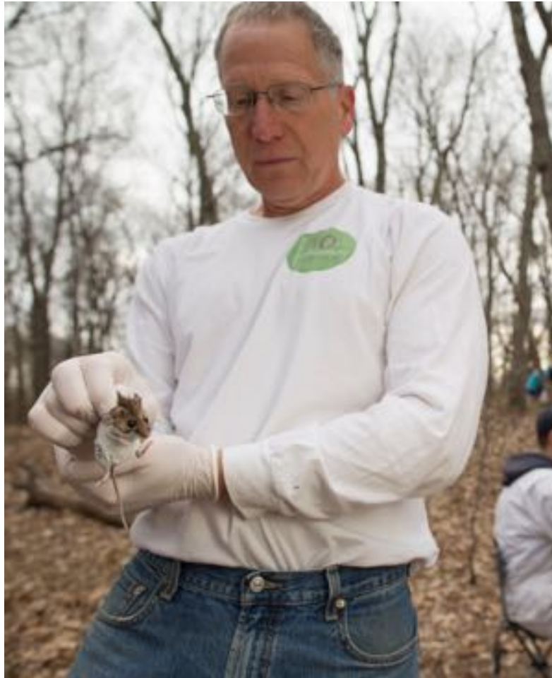
Disease ecologist Richard Ostfeld is one of a growing number of researchers looking at the human health impacts of ecosystem changes through a “planetary health” lens.

“There’s misapprehension among scientists and the public that natural ecosystems are the source of threats to ourselves. It’s a mistake. Nature poses threats, it is true, but it’s human activities that do the real damage. The health risks in a natural environment can be made much worse when we interfere with it,” he says.