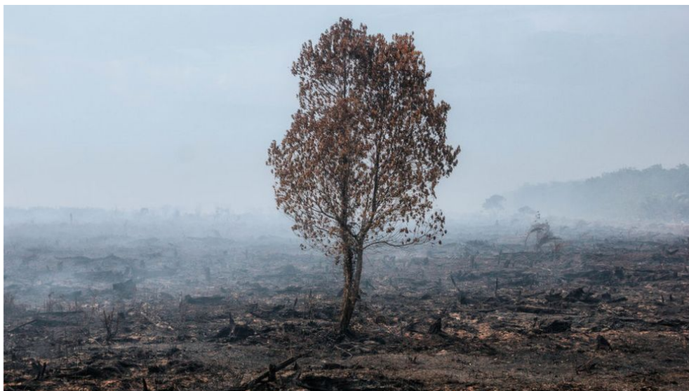
A prolonged drought set up the conditions for fire in this forested area of Indonesia

By Georgina Rannard BBC News Published 5 hours ago