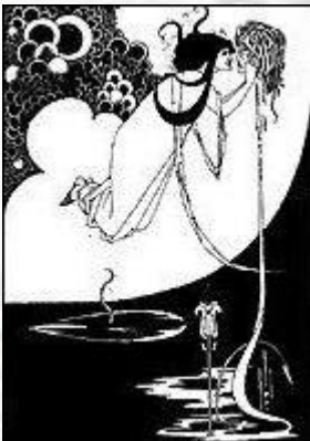
Fig 6.7: The Climax (Wilde)