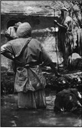
Fig 6.5: Mandaean baptism - the blessing.

called the Nazarenes or Mandaeans from the lower Euphrates, who trace their origin as followers of John who exiled first to Haran and then further south. Although they have also accrued both aspects of the astral ideas of Harran and Persian influence, some authorities attest their heritage to be a genuine ancient pre-Christian tradition.