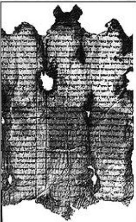
Fig 6.1: From the Dead Sea Scrolls

Our knowledge of the Essenes comes from two sources. The first is commentaries of ancient historians, in particular Philo of Alexandria (20 B.C. - A.D. 40), the elder Pliny (A.D. 23-79) and Flavius Josephus (A.D.37-100) who had visited the Essenes in person. Since the discovery of the Dead Sea Scrolls in the caves above the ruins of the ancient monastery at Qumran, this limited knowledge has been vastly expanded, with a variety of ancient texts, some probably written by the community which has widely come to be identified with the Essene movement. These writings have had a watershed impact on our understanding of the origins of Christianity and of the transitional writings underlying the emergence of Christianity from Jewish ideas.