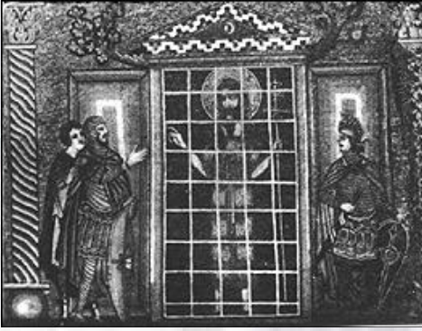
Fig 6.6: John visited by his disciples in prison

Later in John 5:31 Jesus declares that it is John's word for him which confirms him, but that though he "was a burning and a shining light: and ye were willing for a season to rejoice in his light. ... I have greater witness than that of John".