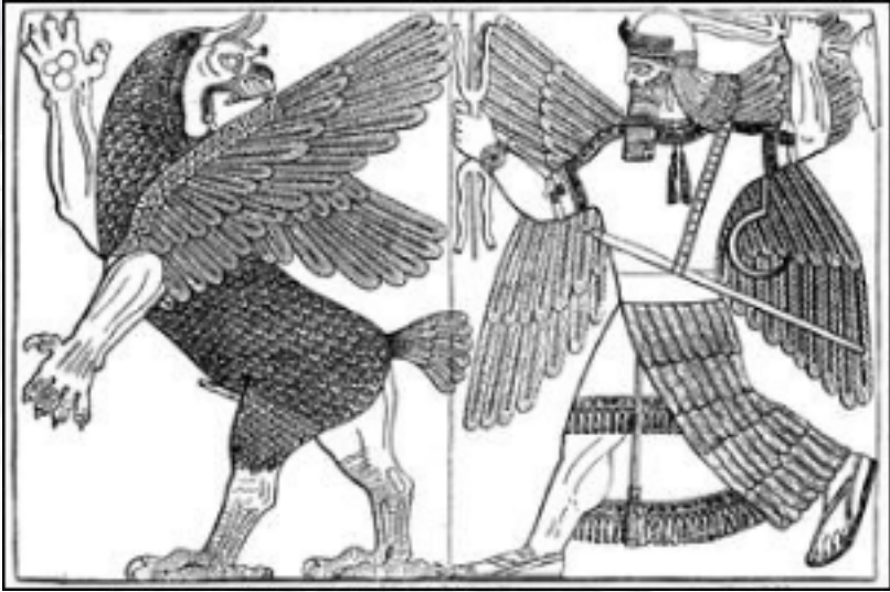
Marduk defeating Tiamat (Contineau).