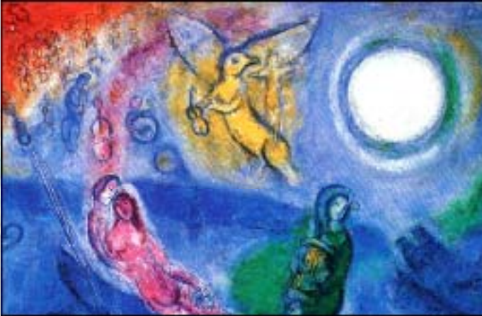
Chagall - The Concert (Chagall) Flying dreams are common.

Gurdjieff, Carlos Castaneda, and Stephen LaBerge all discuss techniques of “lucid dreaming” in which the dreaming and waking state are connected, so that the intent of the dreamer can gain control. The technique is to pick some simple action that the dreamer will perform as an act of volition to assume temporary command of their will, for example the act of looking at the backs of ones hands. As the writings of Castaneda are enigmatic and the authenticity of their inspiration is unresolved, an experimental test of the techniques seemed essential. I thus resolved to adopt the technique of dreaming during a time I happened to be living on my own for a couple of months. Thus as I went to sleep, I looked intently at the back of my hands, fixing my concentration on memorizing the intent of doing the same in dreaming.