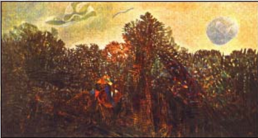
Max Ernst - A Little Calm (Waldenburg)

One of the deepest challenges of the dreaming state is learning to break out of the habitual use of dreaming realities that reflect the familiar conditions of the waking world. Lucid dreams may also tend to inhibit the uncontrolled potentialities of the state by making it more controlled. The world of the dream leads to vastly unfamiliar realities which are strange to us, not only because they open the vast spectre of precognitive consciousness, but because another reality, alien and totally different, stands at the portal. The tendency is for the dreamer to indulge dreams which are bizarre reflections of the world they know, or to lose their conscious grasp altogether.