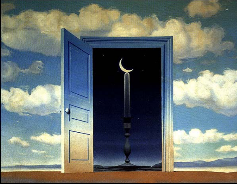
Rene Magritte: The Enchanted Realm (Godwin)