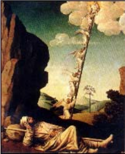
TIME Jacob's Ladder

but it was nothing like the person. Turning back, I looked behind me. At that moment, I saw her! She was actually standing directly behind where I had been. Strangely she hadn't yet seen me either.