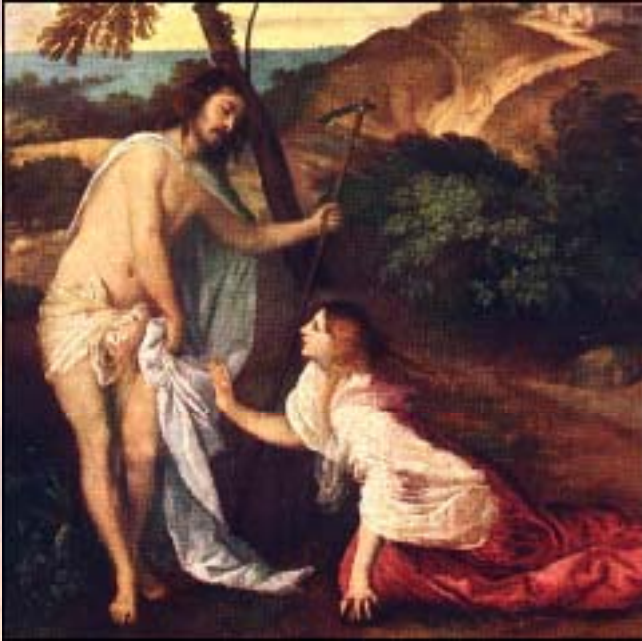
Noli me tangere (Titian Hendy 103)

In John 20:1 it is Mary Magdalen who calls [the risen] Jesus ‘Rabboni’ and who afterwards utters the exaltation to the others: “The first day of the week cometh Mary Magdalen early, when it was yet dark, unto the sepulchre, and seeth the stone taken away from the sepulchre. When she goes to get Peter the disciples did not understand the Resurrection of the dying god: John 20:8 “Then cometh Simon Peter... then went in also that other disciple, which came first to the sepulchre, and he saw [the empty napkins] and believed. For as yet they knew not the scripture, that he must rise again from the dead.” They depart but Mary waits.