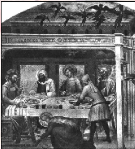
The ‘sinner’ anoints Christ's feet while seven galla emerge Giovanni de Milano.