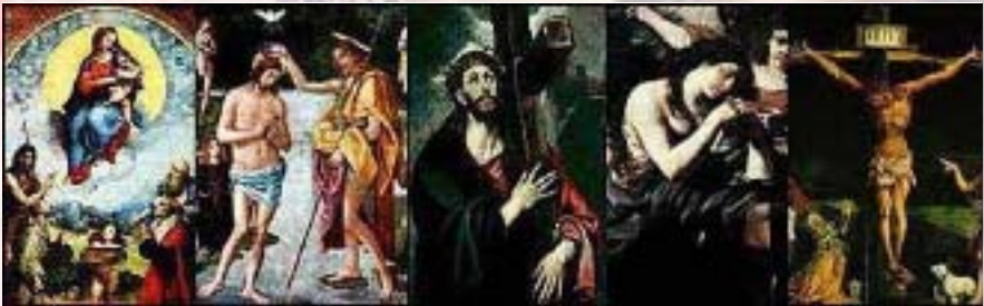
The Ritual Sequence: Sacred birth in the grotto of Aphrodite, the baptism crowned by Aphrodite’s dove, the ritual of the atonement king, the lament of the ‘companion of the Lord’ Mary, the dying god hanging in his tree.

Although Judas’ motives are now monetary, the betrayal role of Judas is again ritual. In John he is chosen by Jesus’ sop, the accursed sacrifice, just as Jesus is the atonement sacrifice. He is the ram in the thicket, the dark one who commends Jesus to his fate by treachery and is then in his turn later sacrificed by spilling his guts in the field of blood. There is scarcely a more Canaanite image than this.