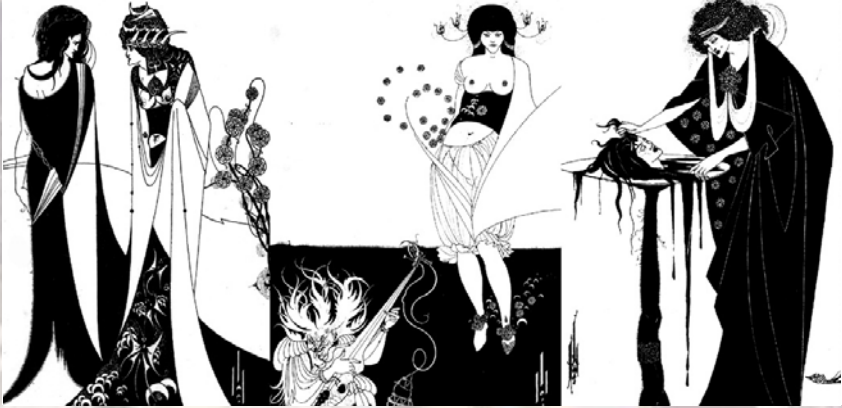
Salome - Beardsley: Jochanan and Salome, The Belly Dance, The Sacrifice (Wilde)

Salome: "Jokanaan, I am amorous of thy body.... Neither the roses in the garden of the Queen of Arabia, nor the feet of the dawn when they light on the leaves, nor the breast of the moon when she lies on the breast of the sea... there is nothing in the world so white as thy body. Let me touch thy body." "Back daughter of Babylon! By woman evil came into the world." "They body is hideous... it is horrible." "It is of thy hair I am enamoured,... like the black grapes that hang from the vine trees in the land of the Edomites."...."I am waiting for my slaves to bring me perfumes and the seven veils and to take off my sandals." Herod: "The moon has a strange look tonight.... She is like a mad woman who is seeking everywhere for lovers. The clouds are seeking to clothe her nakedness.... She reels through the clouds like a drunken woman" (Wilde 2-64)