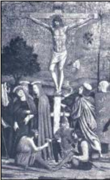
The Three Marys at the crucifixion - Francesca