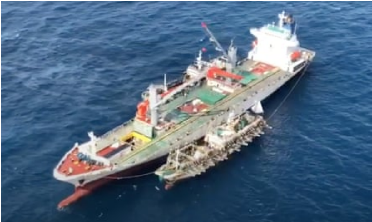
Two squid-fishing boats next to a large vessel, thought to be Chinese-owned, at the edge of Ecuadorian waters.

practices , all of which can facilitate illegal, unreported and unregulated (IUU) fishing.