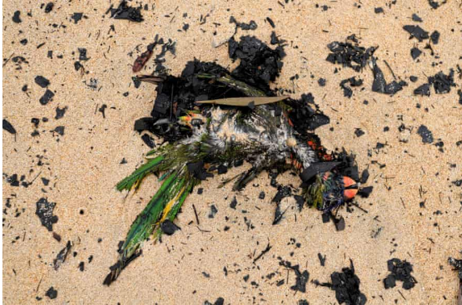
Australia saw a devastating bushfire season in 2020.

industrial levels and is set to reach 1.5C warming between 2030 and 2052.