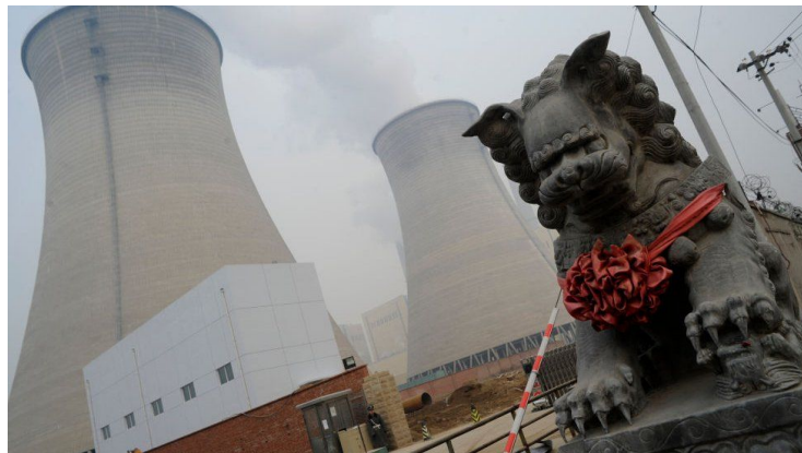
China emitted 27% of the world's greenhouse gases in 2019